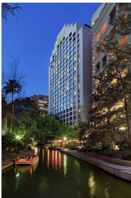
Our hotel on the Riverwalk at dusk.