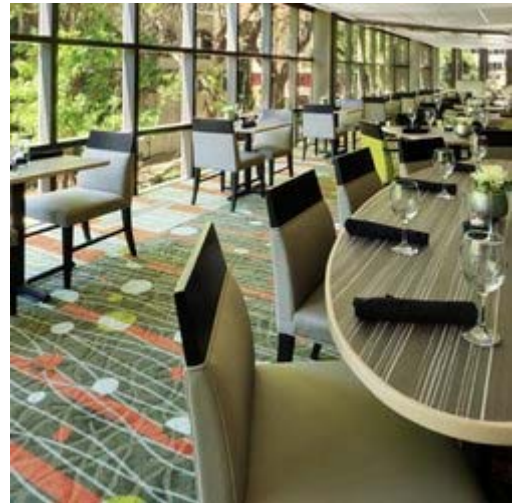
In the hotel.