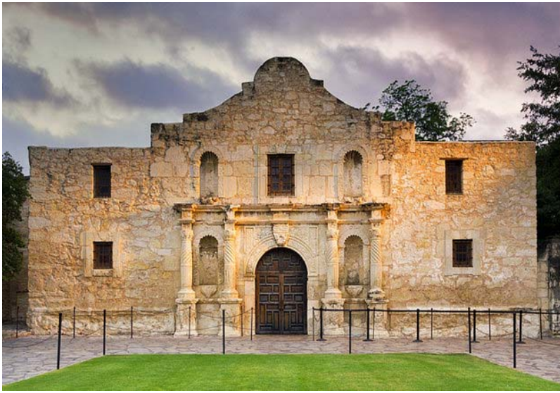
The Alamo in San Antonio.